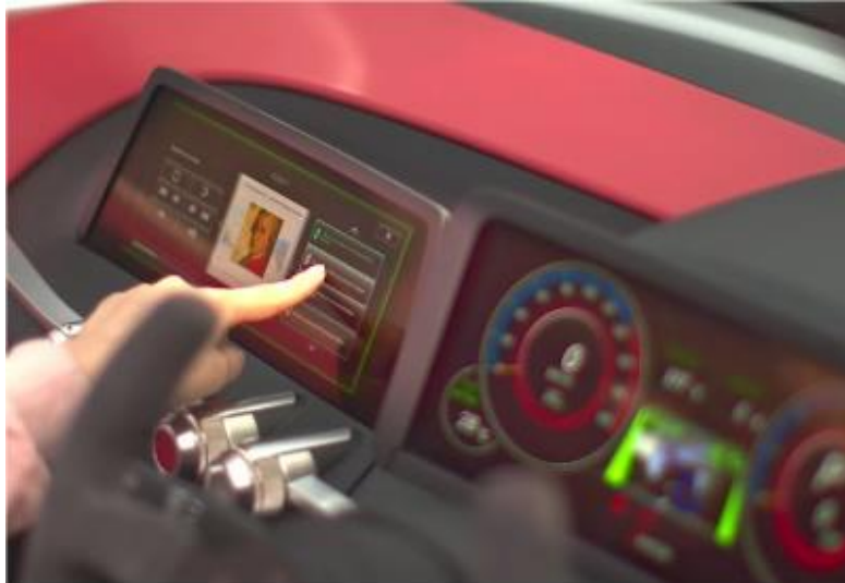
HAPTIVITY ® for automotive infotainment display

Kyocera’s latest developments for creating a safe and comfortable mobility society include its “3D Augmented Reality Head-up Display”, which supports driver safety and comfort — as well as Kyocera’s patented HAPTIVITY ®1 touchscreen display technology, which simulates a variety of realistic tactile sensations to revolutionize the human-machine interface.