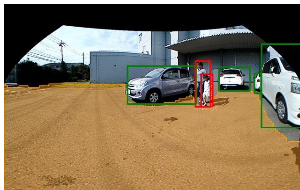
AI Camera digital demonstration (left) and detection example (right)